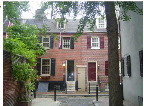
Figure 11: Attached dwellings with varied door and shutter coloration, and inverted window and door placements consistent with the colonial style.