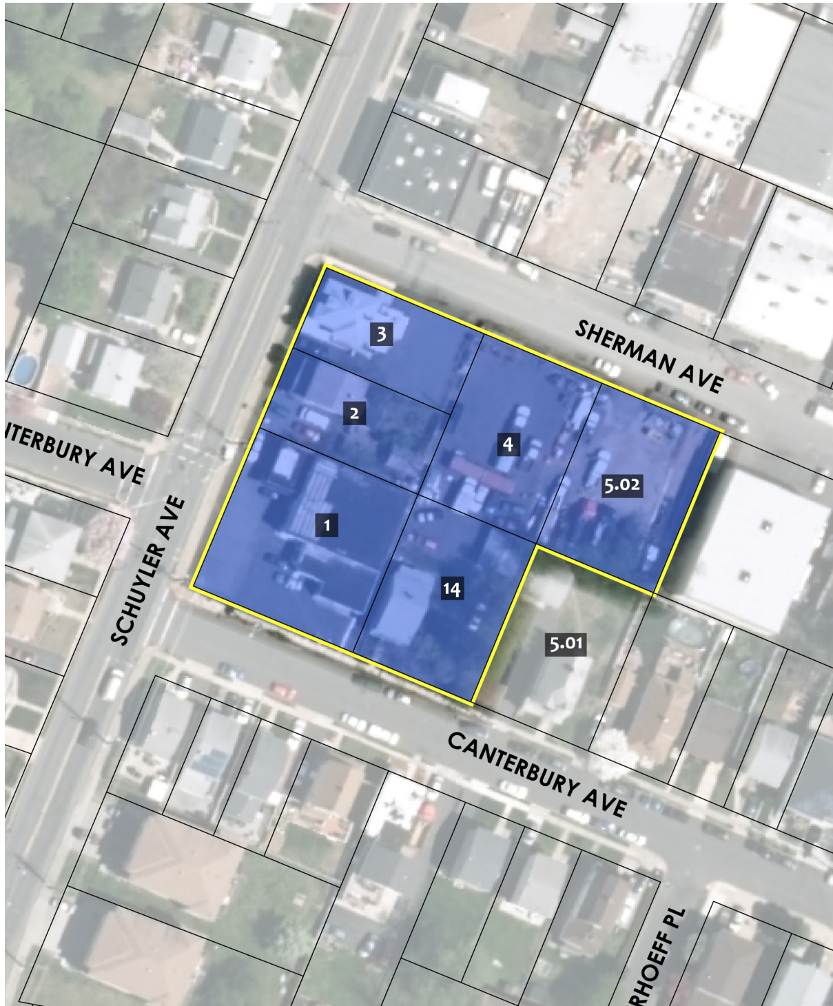
Figure 1: Designated Lots Comprising the Redevelopment Area

Avenue, north and east of the Study Area, are industrial or commercial uses including automobile repair and distribution uses. All of the uses fronting on Canterbury Avenue south and east of the Study Area and all of the uses fronting on Schuyler Avenue west and south of the Study Area and the majority of uses fronting on Schuyler Avenue north of the Study Area are residential dwellings with one or more units.