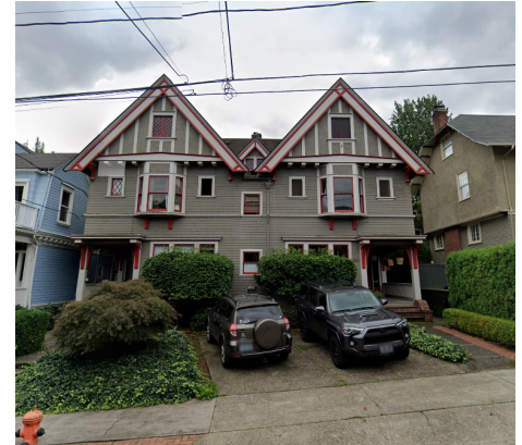
Figure 2: Semi-detached dwellings with front loaded parking.