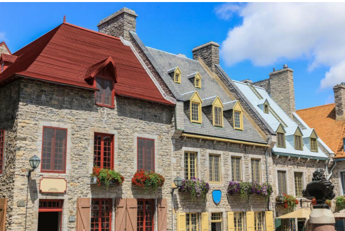
Figure 14: Attached buildings having varied color patterns, as well as fire walls and chimneys separating units.