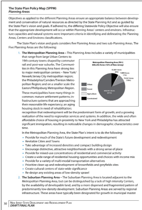
Figure 16: New Jersey SDRP - "Metropolitan Area 1"