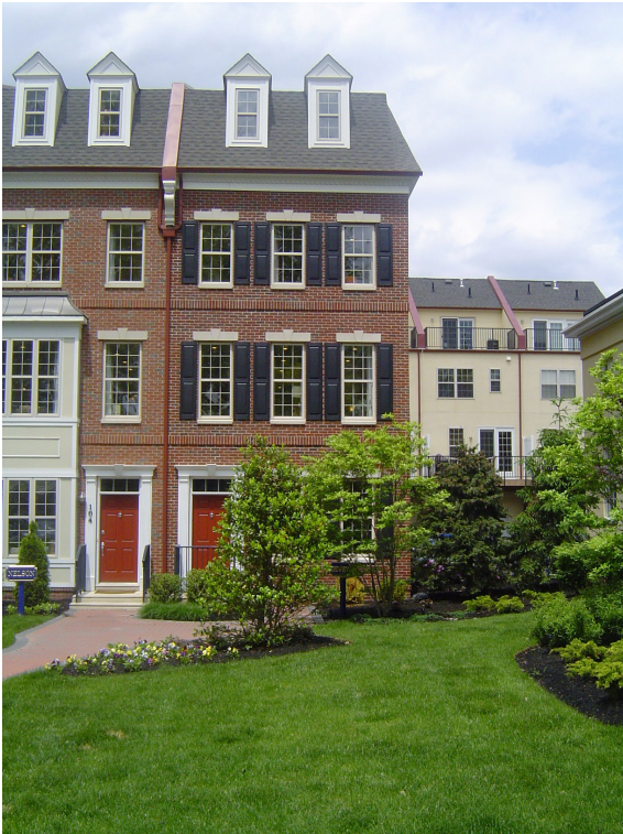
Figure 13: Attached dwellings with alternating window and wall materials, inverted window and doors, and use of gutters and fire walls to separate units.