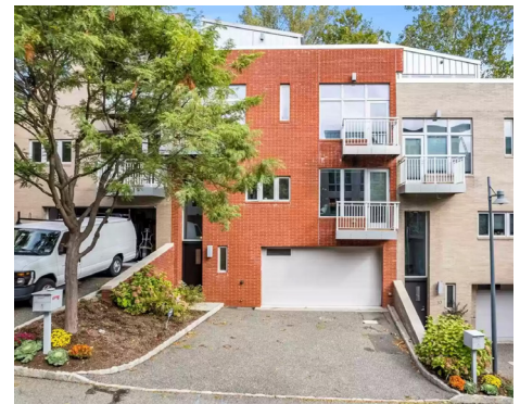
Figure 4: Attached dwellings with front loaded parking and varied architectural style.