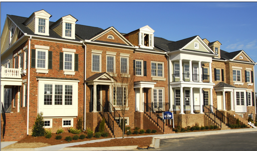
Figure 15: Townhouses with varied roof styles, facade materials, and architectural treatments.