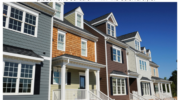
Figure 12: Attached dwellings with varied but complementary materiality, window treatments, and roof styles, and a natural-appearing variation in the building line.