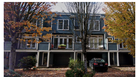
Figure 3: Attached dwellings with front loaded parking and uniform style.