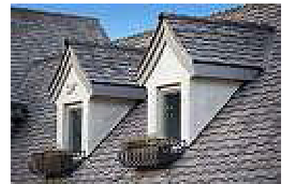
Figure 9: Dormers on a gable roof.