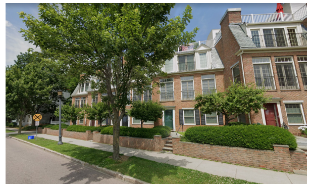
Figure 10: Attached dwellings with Juliet balconies and rooftop terraces, facade articulation in the form of varied setbacks and projections.